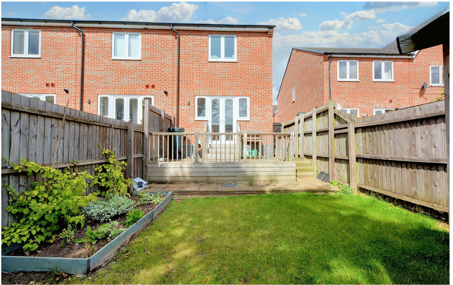
A modern two-double bedroom end-terrace house.

Situated in this popular and convenient residential location, readily accessible for a variety of local shops and amenities including schools, transport links, Beeston Town Centre and the A52 and M1 for journeys further afield, this fantastic property is considered an ideal opportunity for a range of potential purchasers including first time buyers, young professionals and investors.